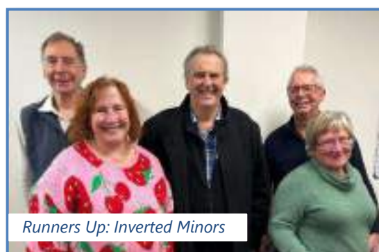
Runners Up: Inverted Minors