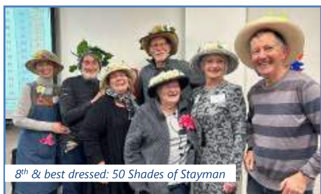
8th & best dressed: 50 Shades of Stayman